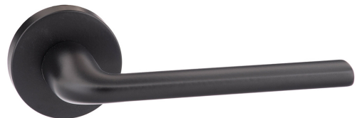
Finish Photographed: Matt Black (MB)